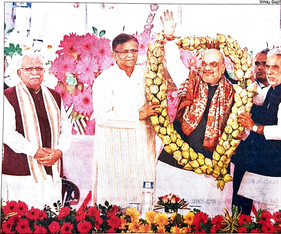
Amit Shah at Jan Utthan rally in Faridabad on Thursday

126km rail corridor from Palwal to Sonapat Land acquisition for project complete 5 years estimated time of completion